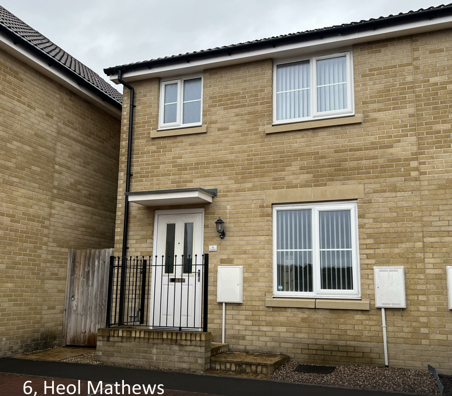
6, Heol Mathews Bridgend, CF35 6JU